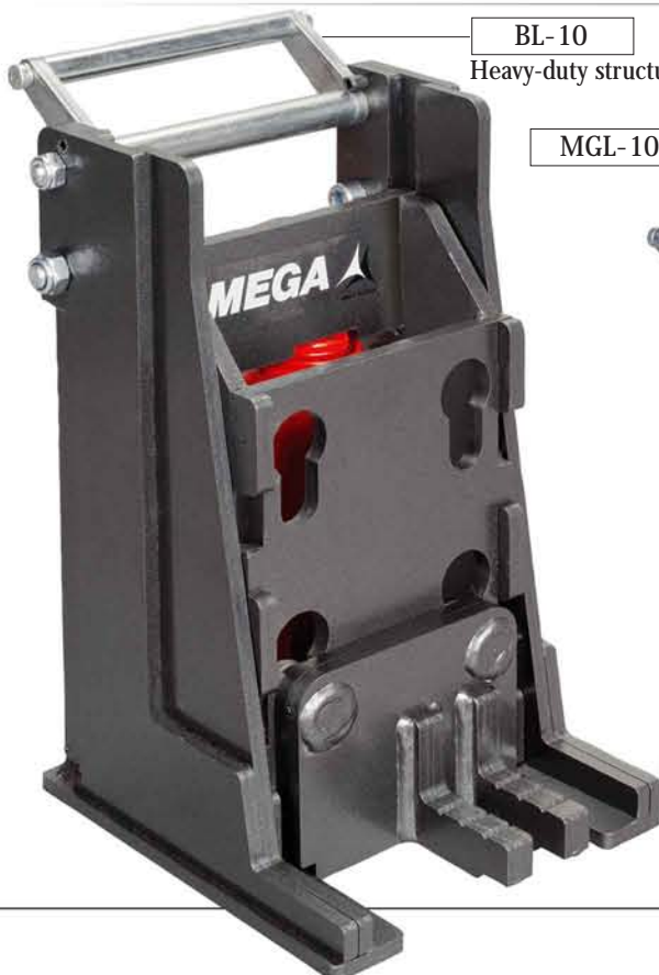
BL-10 Heavy-duty structure