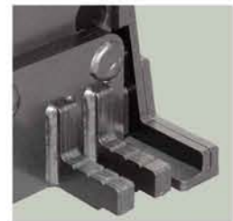
Extra low profile lifting toe (25mm)

MGL-10 is the combination of BL-10 heavy-duty structure and MG-10 bottle jack. (Can also be used with MG-8 bottle jack)